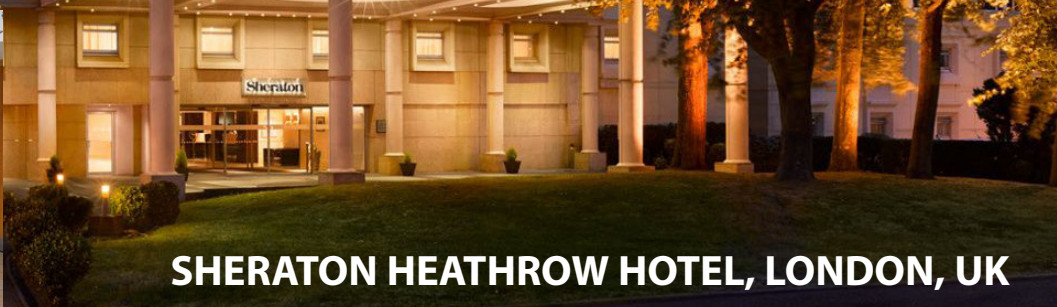
SHERATON HEATHROW HOTEL, LONDON, UK

Bringing together an international audience of leading academics, expert practitioners and supporters of the Respiratory Effectiveness Group to promote quality real-life research and translate the value of this in routine practice.